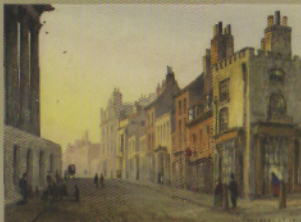
Town Hall and Congreve Street, 1833. [Misc Prints/51]

This leaflet contains two trails that can either be taken separately or done together as a single heritage trail through the city centre.