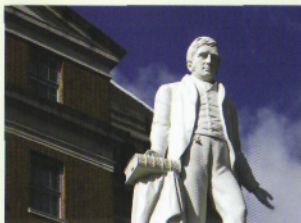
Statue of Sturge, Five Ways, 2006. (Brigitte Winsor)

The statue of Joseph Sturge was unveiled in 1862. Carved into the stone around the statue are the words 'Peace', 'Temperance' and 'Charity'. Two symbolic angel figures stand guard, one holding a laurel leaf, the other reaching towards the figure of a child, indicating a young slave. A further inscription reads: 'He laboured to bring freedom to the negro slave, the vote to the British workman, and the promise of peace to a war worn world'. Sturge formed the Birmingham Anti-Slavery Society in 1826 and worked alongside the already functioning Birmingham Ladies Society for the Relief of Negro Slaves and a number of black abolitionists including Frederick Douglass.